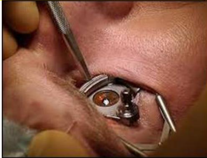
Image of a Lasik Eye Surgery procedure (above) versus an image of an Abortion Surgery on a 20 week old unborn (below), decided by the City of San Antonio Development Services Department to be a material similar use for zoning and land-use as they both are outpatient “day” surgeries. Do you think they look similar?

Mayor’s office informed SAFA on June 29, 2015 that this Eye Surgery Center that was the benchmark used to make a Material Similar Use decision is not even zoned C-1 but is actually zoned C-2.